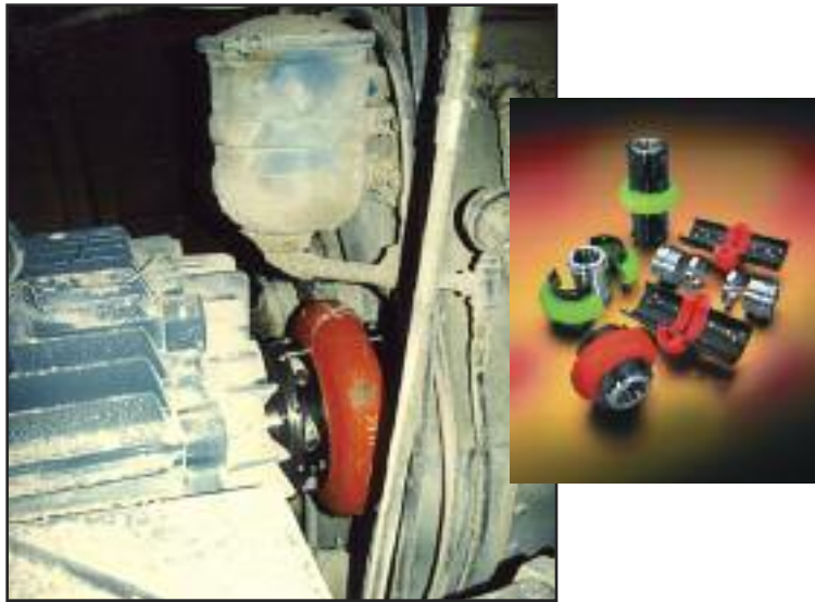
OMEGA COUPLING - PELLET MILL APPLICATION