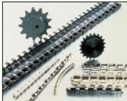
ATTACHMENT CHAIN AND ACCESSORIES