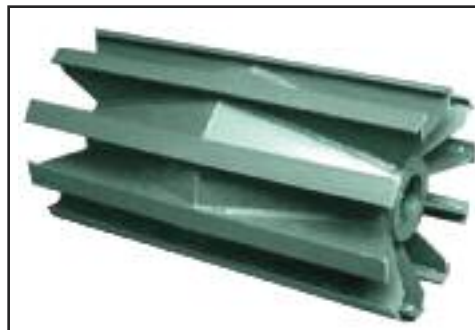
DRUM AND WING PULLEYS