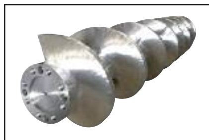
STAINLESS STEEL SCREW CONVEYOR