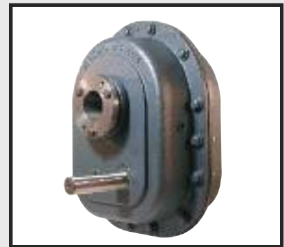
SHAFT MOUNT REDUCER