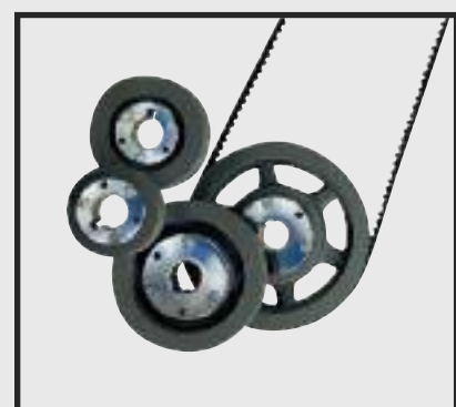
SHEAVES & BELTS