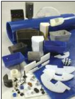
BUCKET ELEVATOR AND CONVEYOR COMPONENTS

BDI's specialty capabilities include, but not limited to, custom designed components, specialty chain and custom molded UHMW profiles.